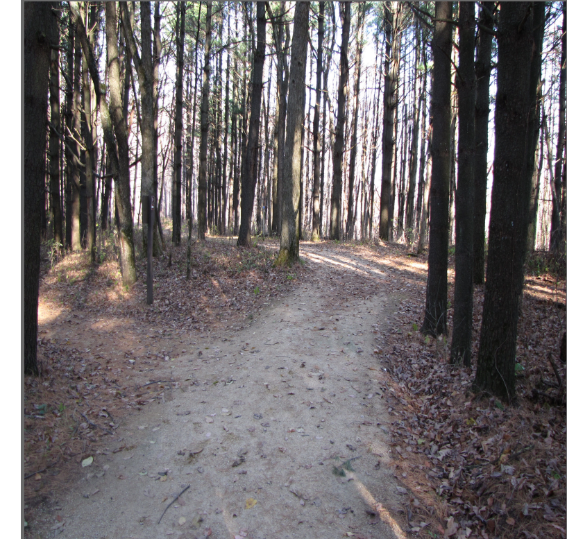
Mostly go straight