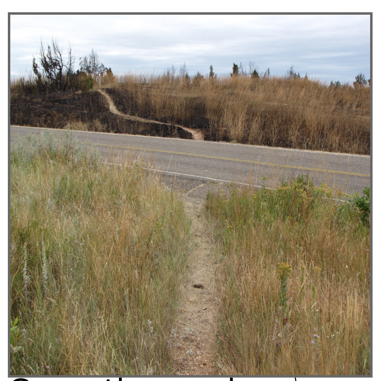
Cross the road