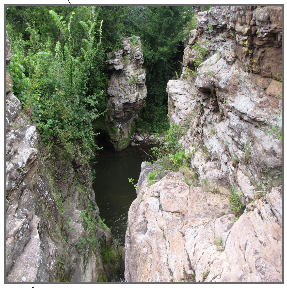
In the gorge