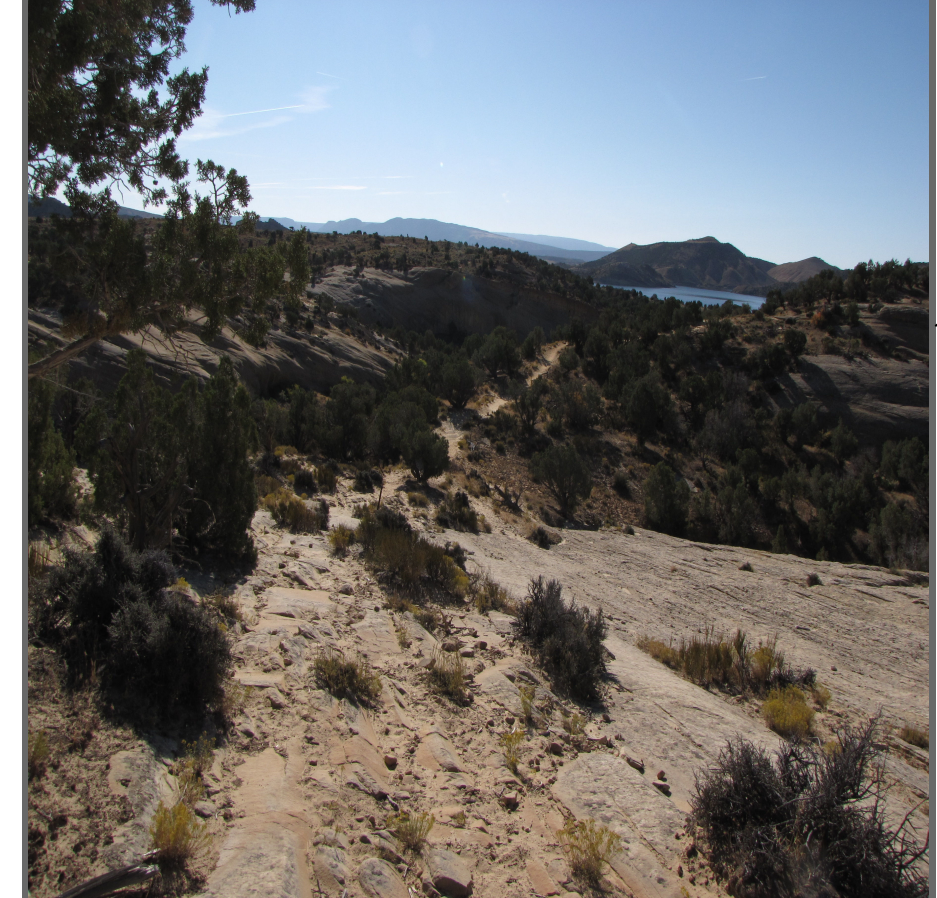
Hard to spot