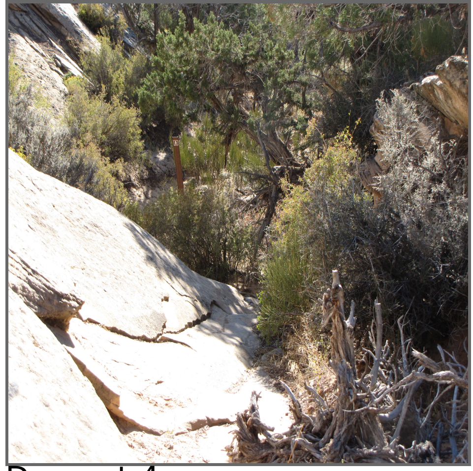
Draw at 4