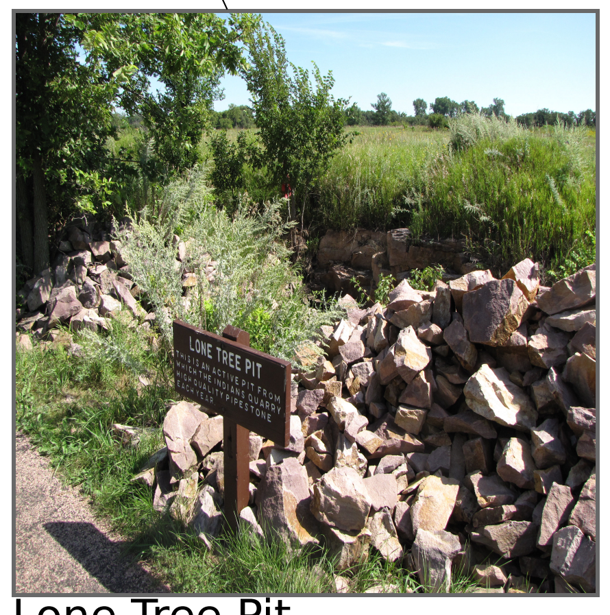
Lone Tree Pit