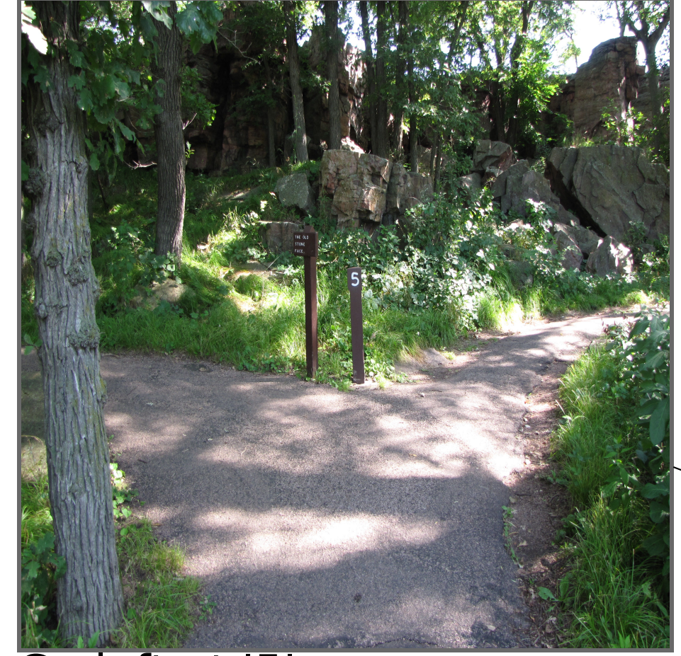
Go left at '5'