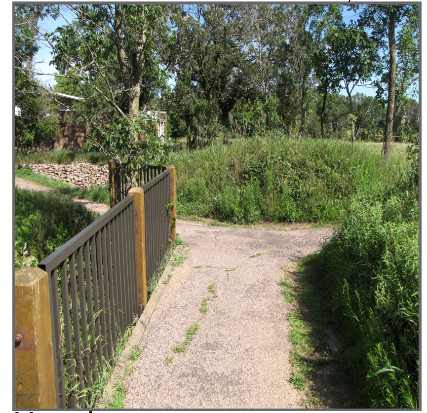
Head to car