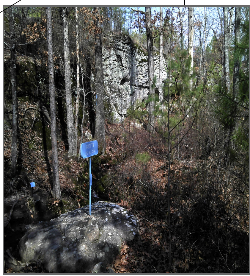
Right to grotto