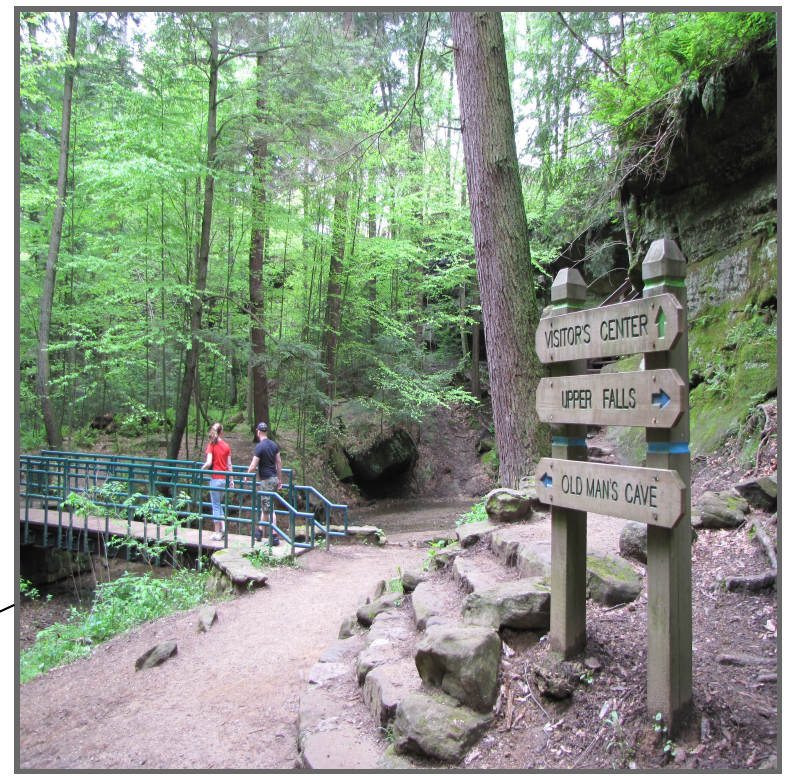
Left across Bridge