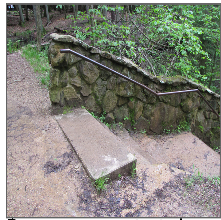
Down cement stairs