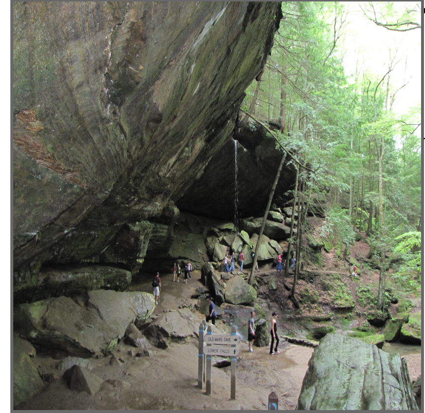
Old Mans Cave