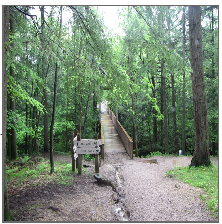
Cross the bridge