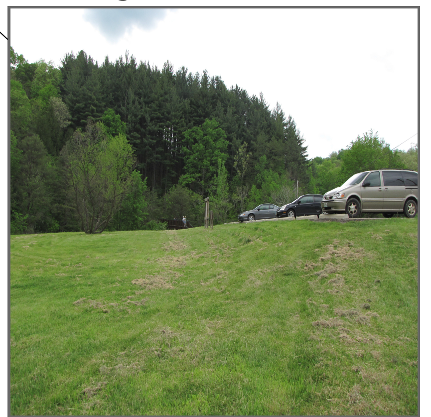
Hike through grass