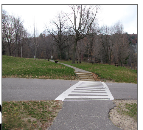
Road and tracks