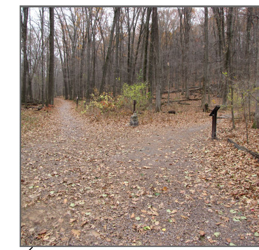
Right and up