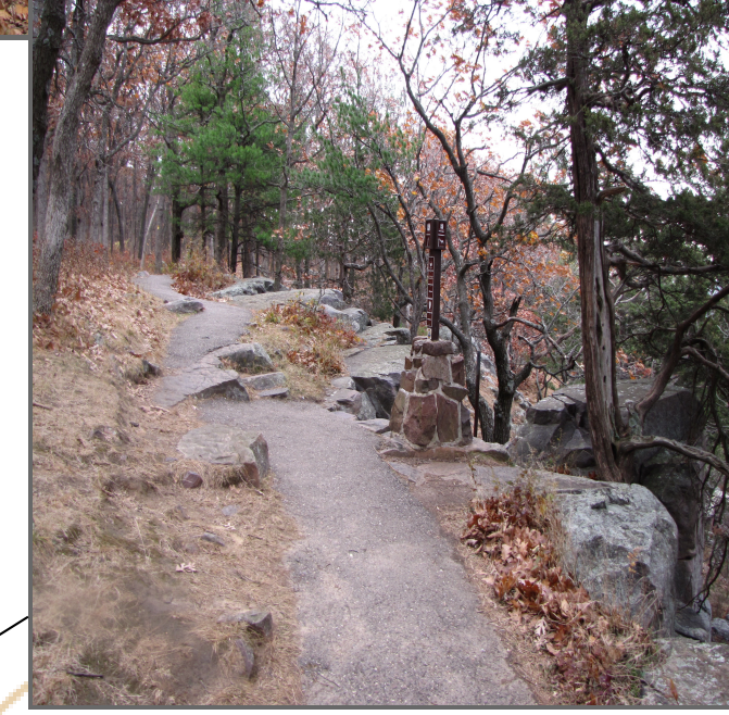
Right to DD