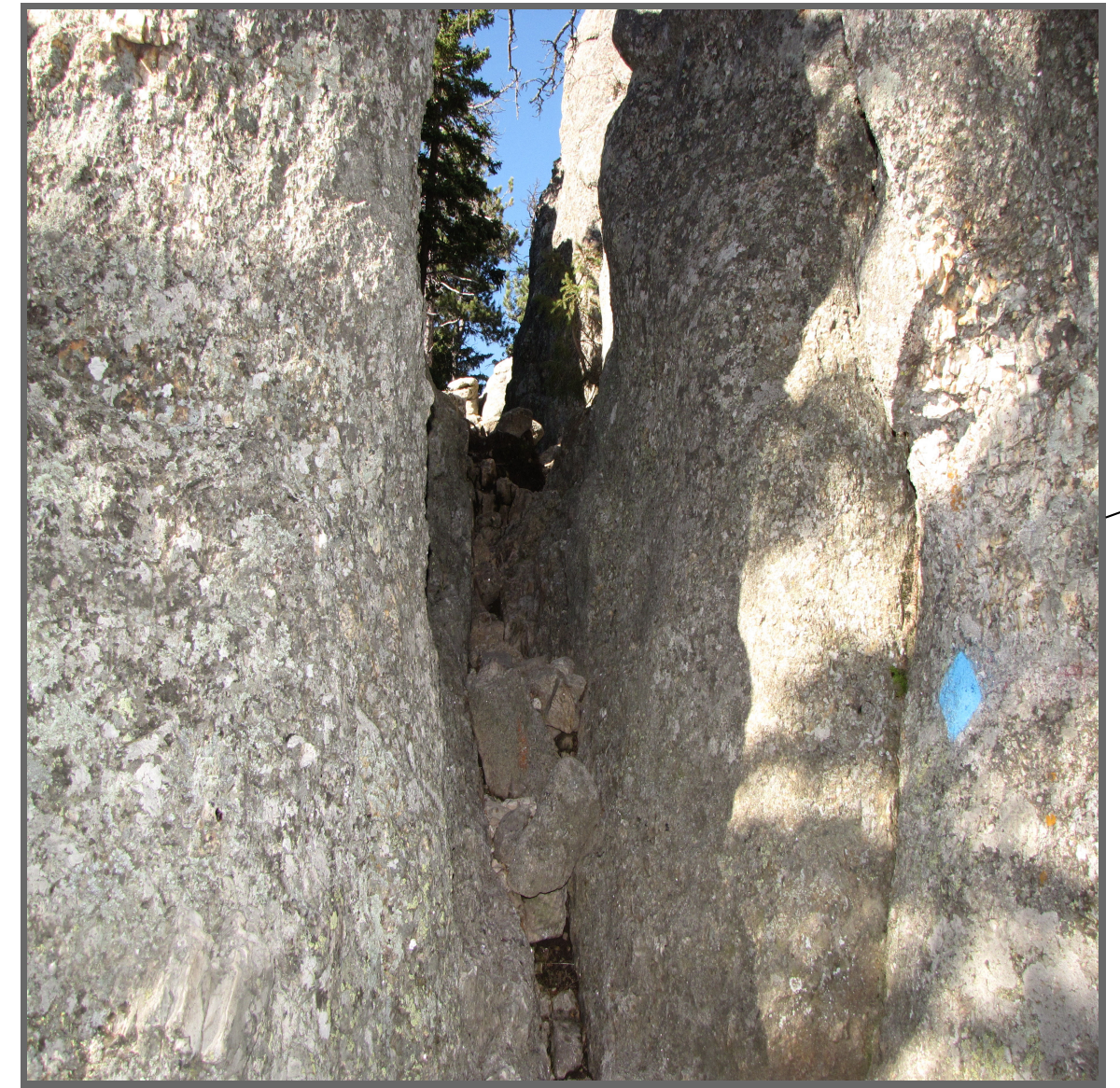
Into the gap