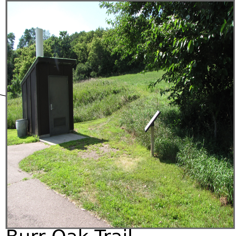
Burr Oak Trail