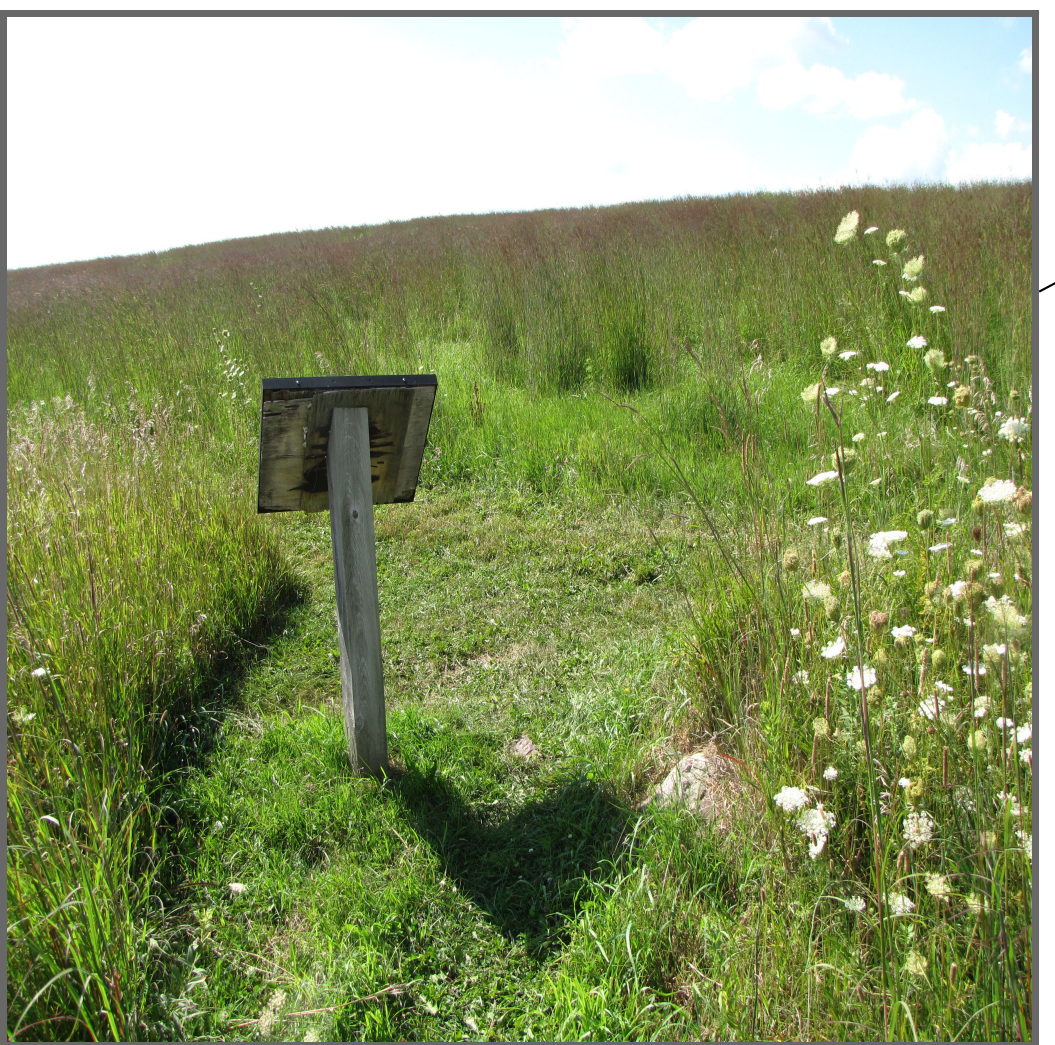
Tee - go right