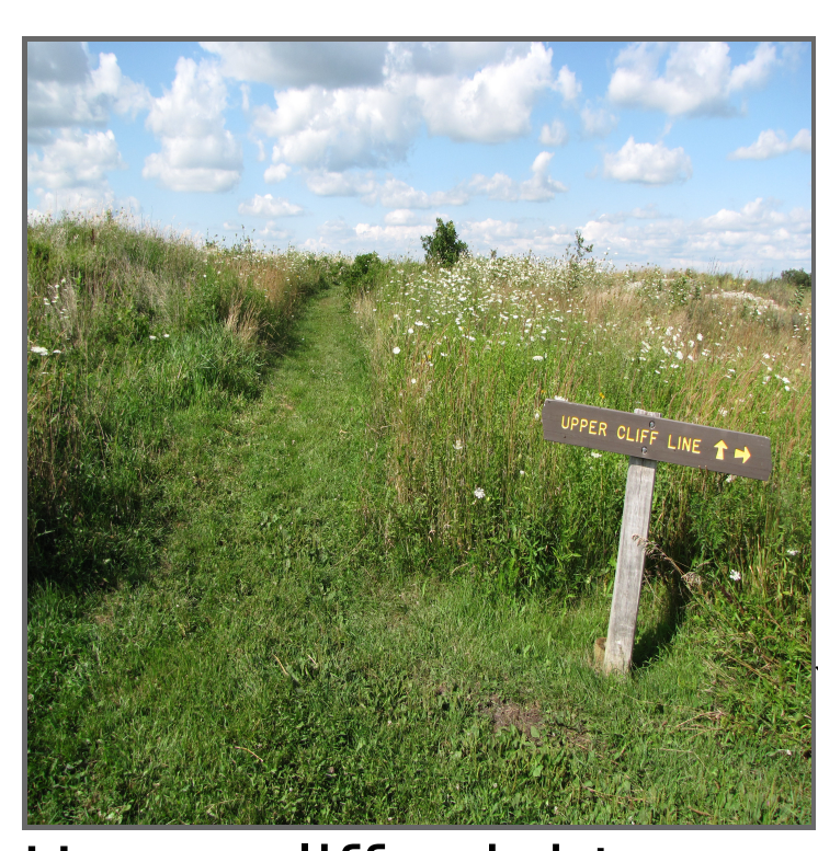
Upper cliff - right