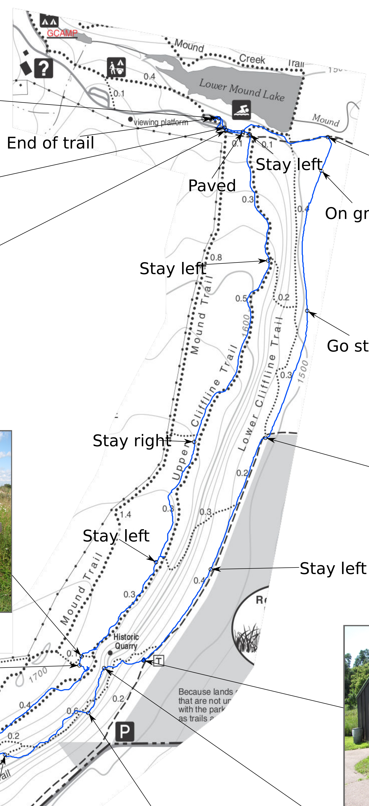
End of trail